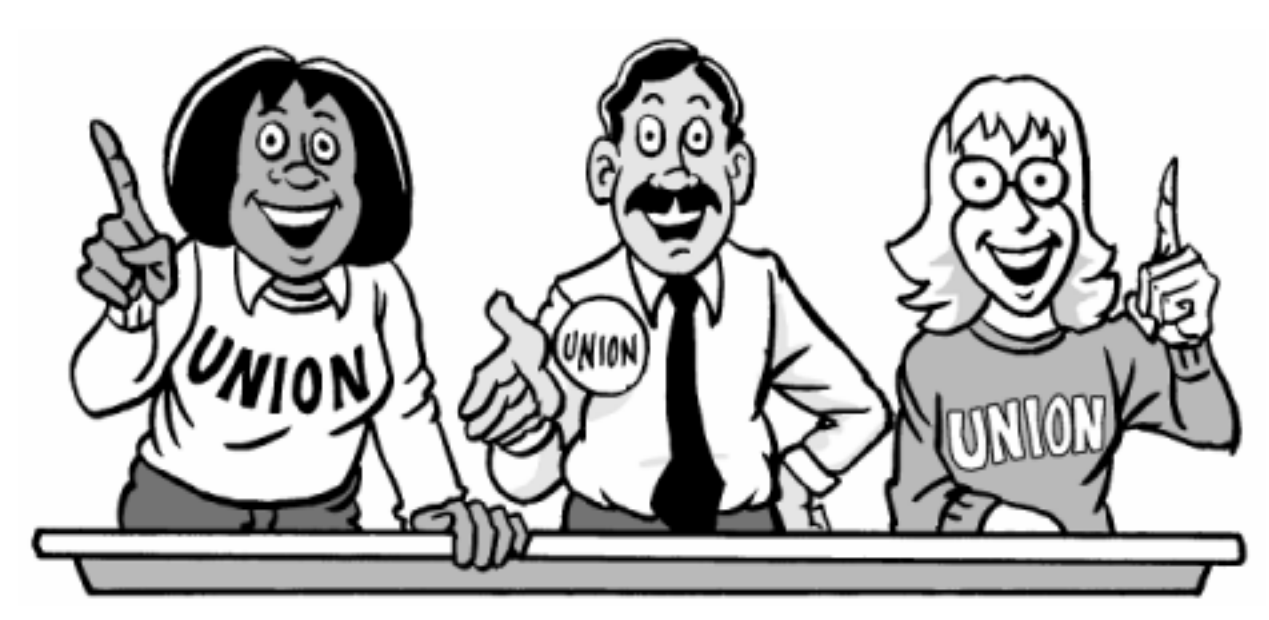
Labor Safety and Health Training Project • National Labor College • November 2006 • Page 6

joint labor management committee is really effective in correcting health and safety hazards.